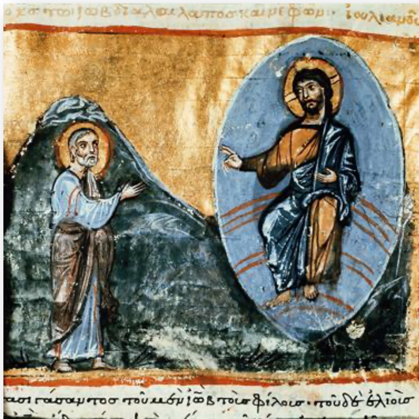
Anonymous Byzantine illustration. The pre-incarnate Christ speaks to Job