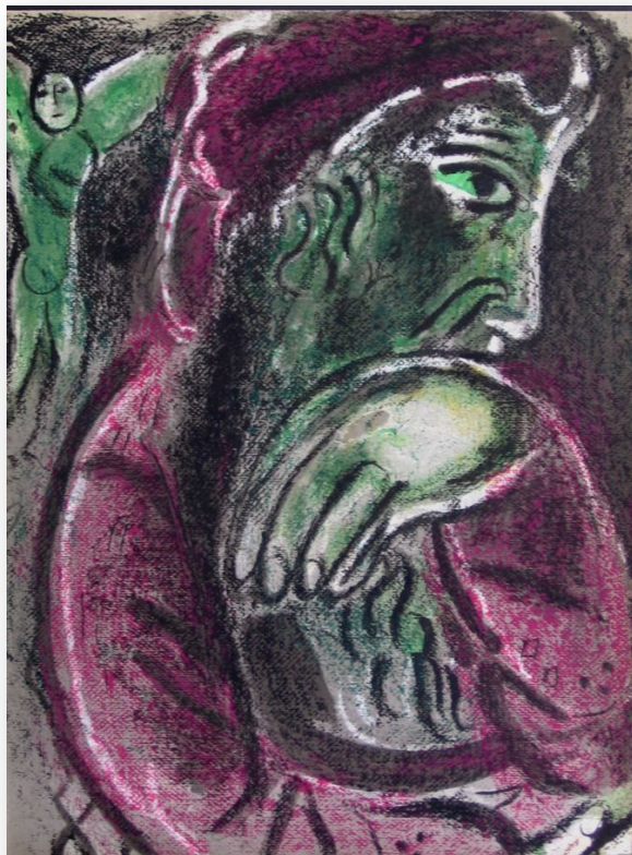
Marc Chagall – Job's Despair ; Biblical lithograph

9 By the breath of God they perish, and by the blast of his anger they are consumed.