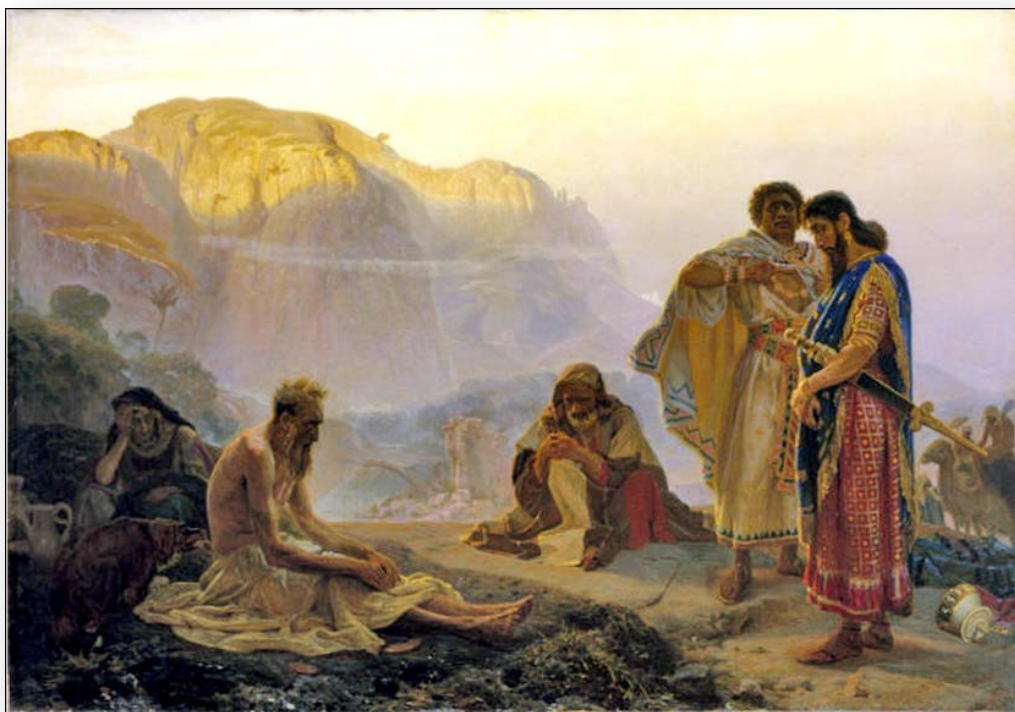
Job and His Friends by Ilya Repin (1869)